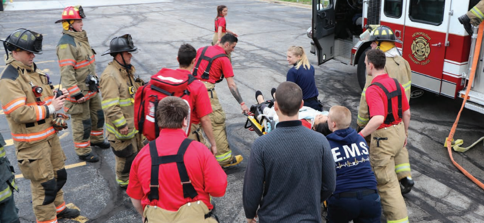
Photo of emergency response team during a mock emergency drill.